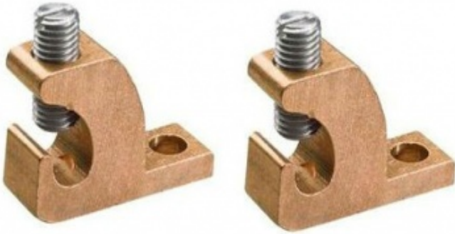
Copper Lay in grounding lugs For Solar panels

Conex Offers Copper Lay in Lugs Copper Lay in grounding lugs for solar panels and swimming pool applications.